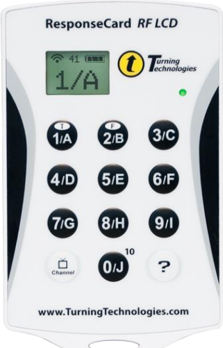
RF - LCD