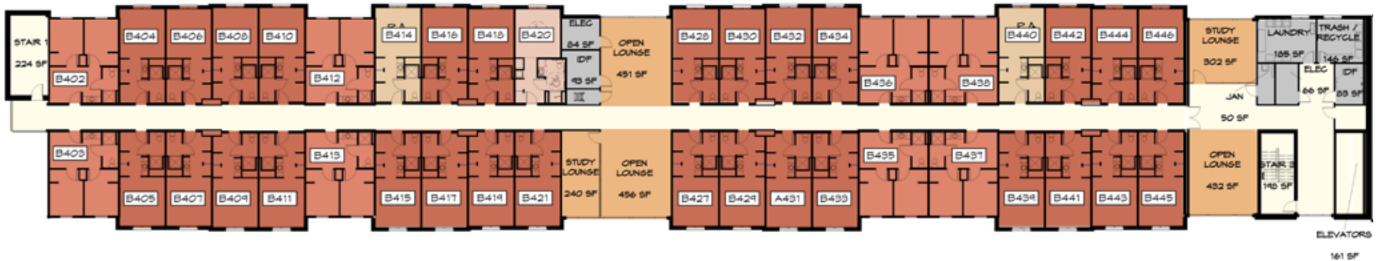
BUILDING B FOURTH FLOOR PLAN