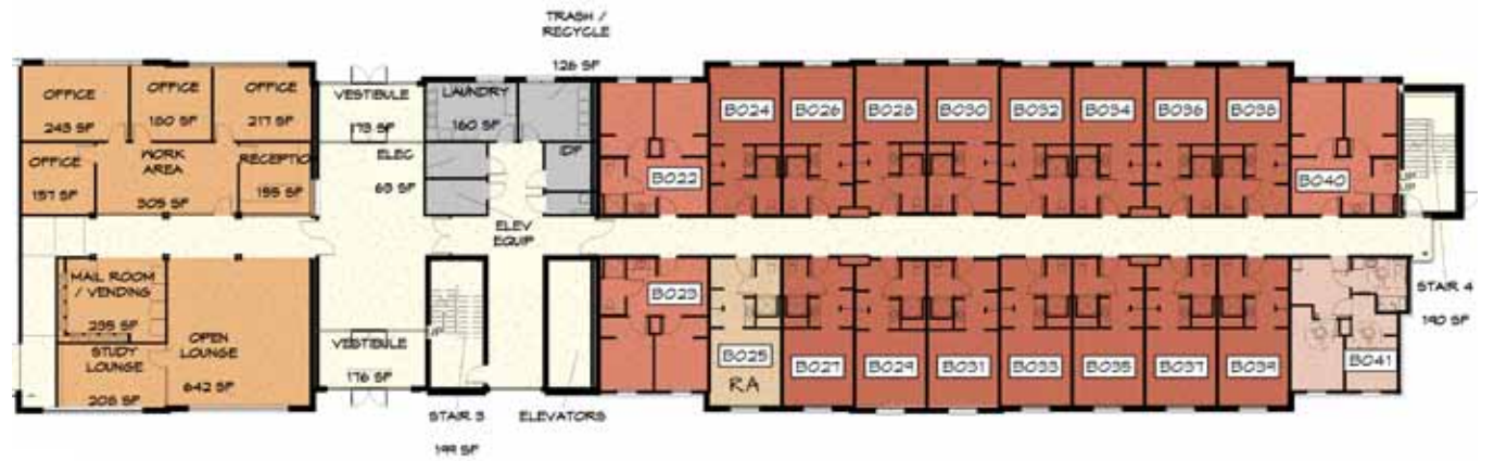
BUILDING B GROUND FLOOR PLAN