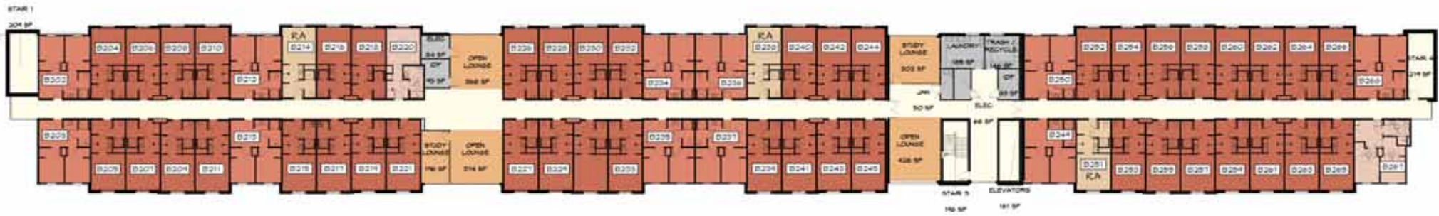
BUILDING B SECOND FLOOR PLAN